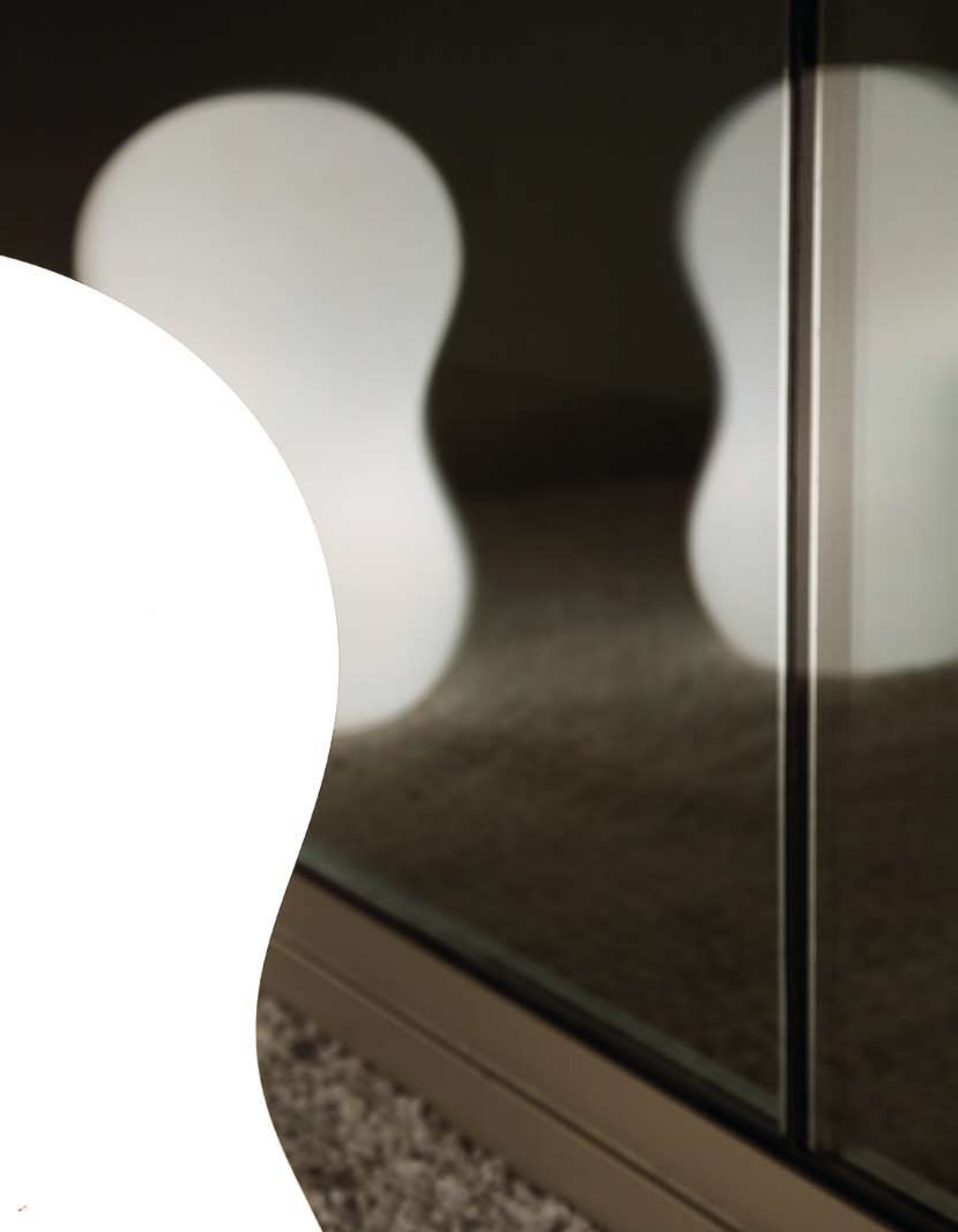
Svetlo design Karim Rashid lampada / lamp