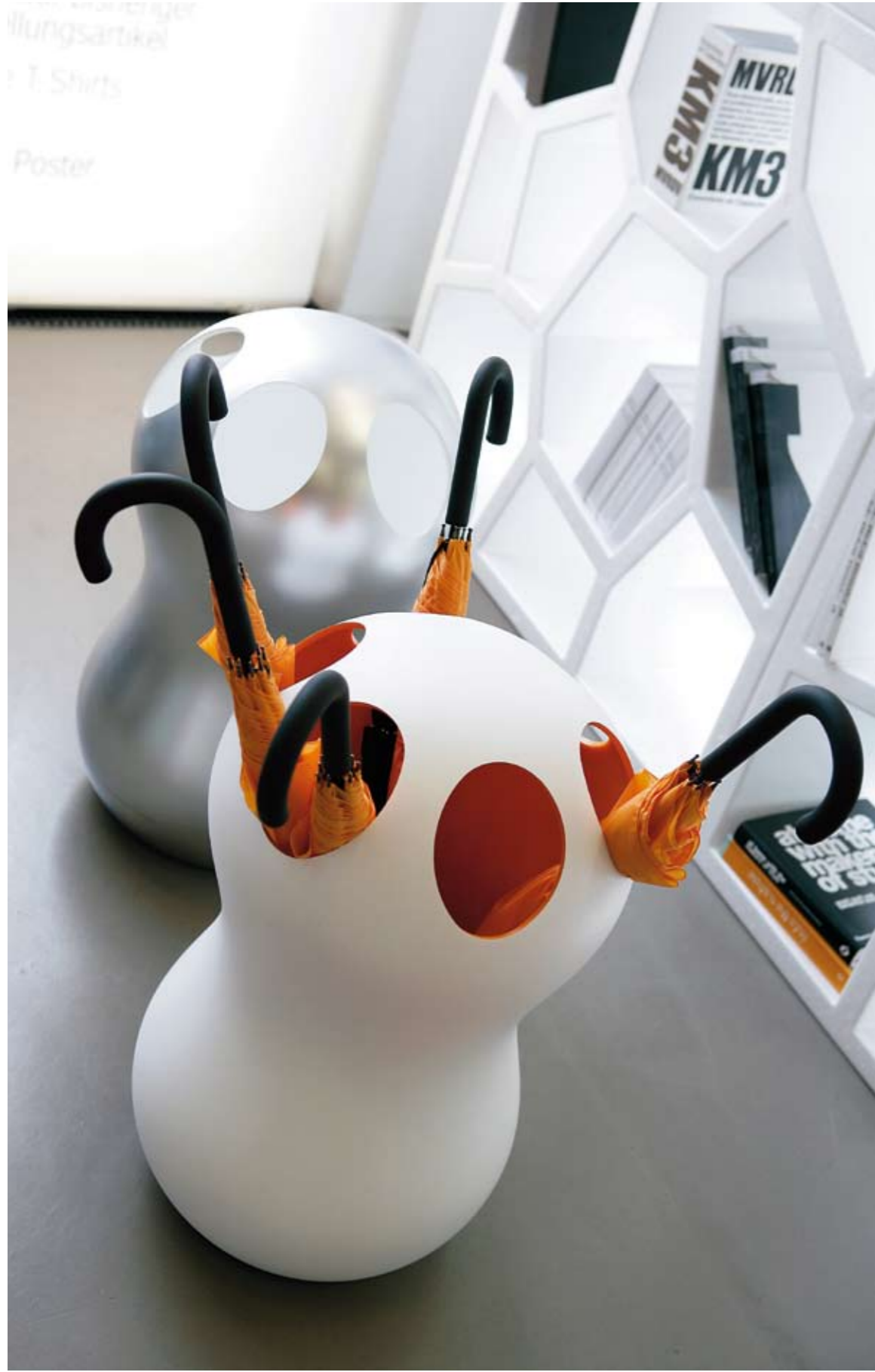
Opus Incertum design Sean Yoo libreria-espositore / bookshelf-display cabinet Zontik design Karim Rashid portaombrelli / umbrella stand