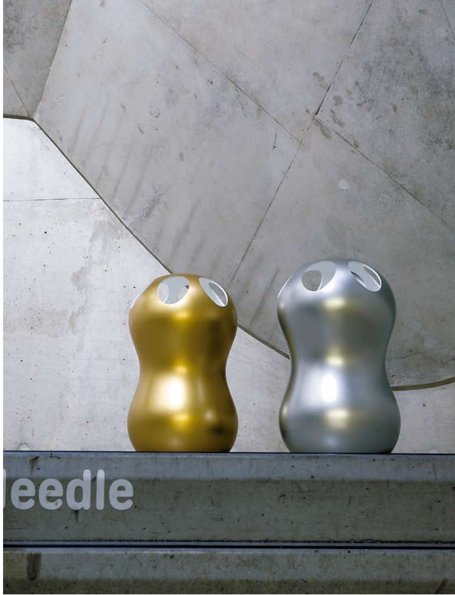
Zontik design Karim Rashid portaombrelli / umbrella stand