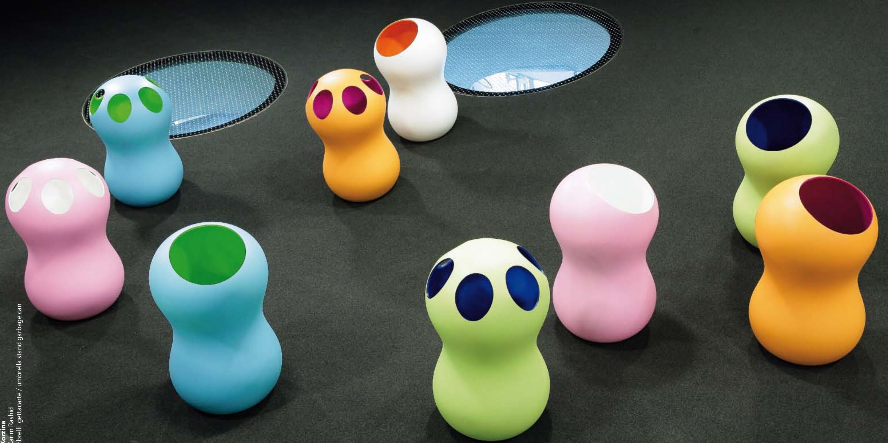
Zontik Korzina design Karim Rashid portaombrelli - gettacarte / umbrella stand - garbage can