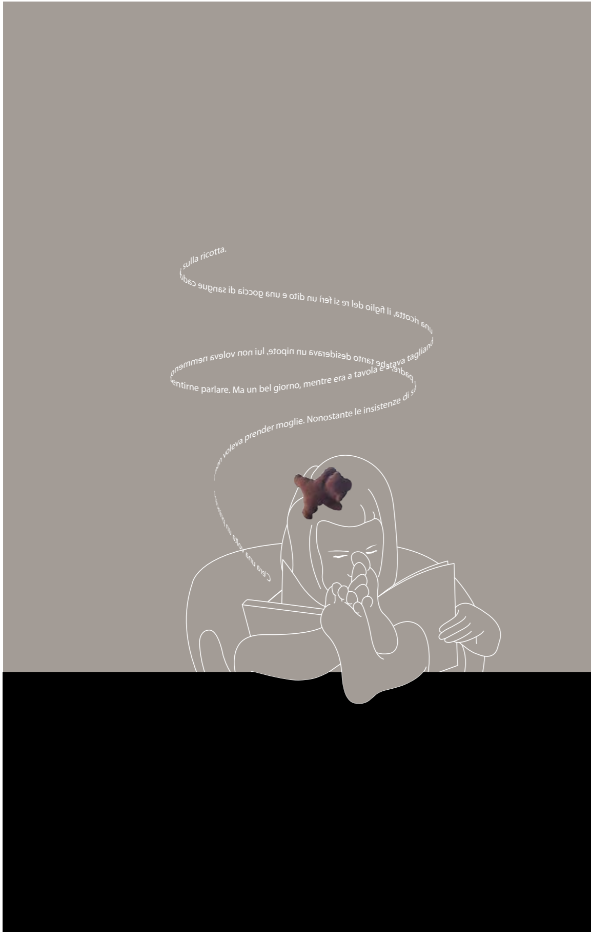
Print design Giusi & Fabio Lombardo portariviste / magazine rack