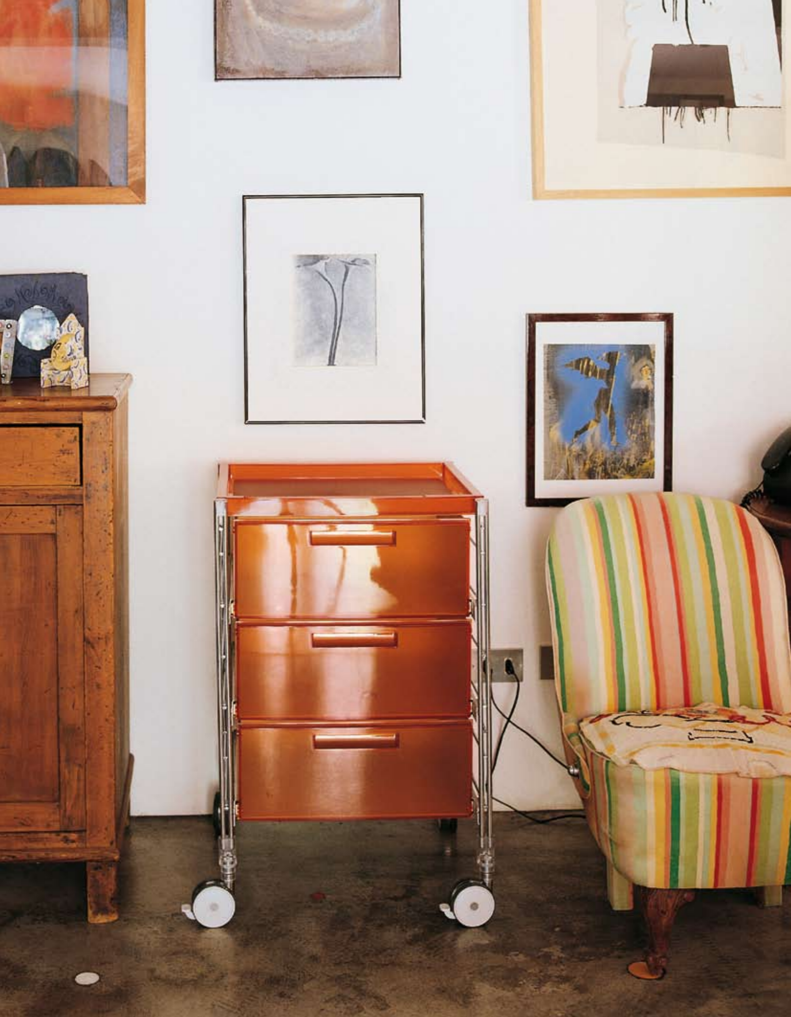
Festival Trolley design Baldanzi & Novelli cassettera modulare / modular drawer