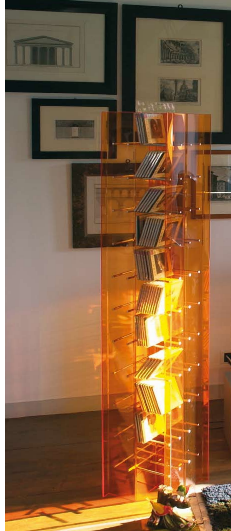
Music Totem design Giusi & Fabio Lombardo porta cd / cd rack